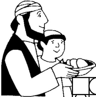
Church Clip Art Mega Pack, Gospel Light, Ventura, CA

Open a King James Bible to Proverbs 11:17. All the words of this verse fit into the puzzle squares. Horizontal words must be spelled from left to right. Vertical words must be spelled from top to bottom. Circled letters complete the Puzzle Bonus.