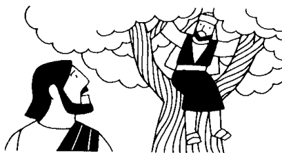
Gospel Light Bible Story Clipart

____ Zacchaeus Climbs a Sycamore Tree to see Jesus