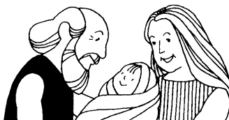
Gospel Light Bible Story Clipart