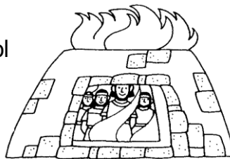
Gospel Light Bible Story Clipart