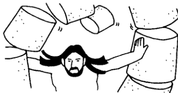
Gospel Light Bible Story Clipart