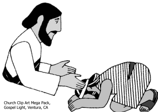
Church Clip Art Mega Pack, Gospel Light, Ventura, CA