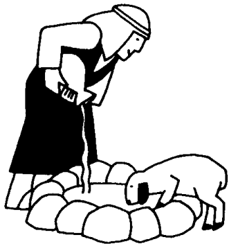
Church Clipart Mega Pack