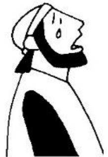
Gospel Light, Ventura CA