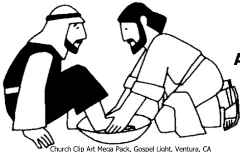
Church Clip Art Mega Pack, Gospel Light, Ventura, CA