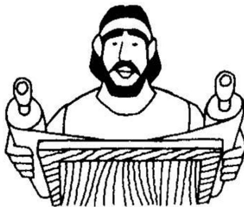
Church Clip Art Mega Pack, Gospel Light, Ventura, CA