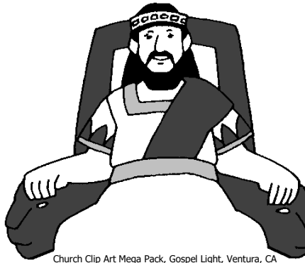
Church Clip Art Mega Pack, Gospel Light, Ventura, CA

Enter the word maze at the top left. Move horizontally or vertically, but never diagonally. Use every letter and never skip a letter. Never double back. Exit the maze at the lower right. What is the Bible message? Write it below as you find each word. Circled letters complete the Puzzle Bonus.