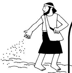
Church Clip Art Mega Pack

All the words of this passage are contained in the block of 121 letters. Words run horizontally, vertically, and diagonally. They may be spelled forward or backward. Do not use a word that is found completely within another word. Twenty unused letters solve the Puzzle Bonus. Thirteen of them are already in place.