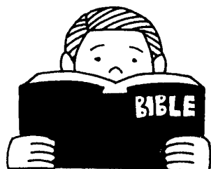
Church Clip Art Mega Pack, Gospel Light, Ventura, CA

All the words of this passage are contained in the block of 64 letters. Words run horizontally, vertically, and diagonally. They may be spelled forward or backward. Do not use a word that is found completely within another word. Unused letters solve the Puzzle Bonus.