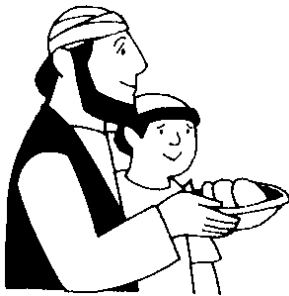
Church Clip Art Mega Pack

All the words of this passage are contained in the block of 64 letters. Words run horizontally, vertically, and diagonally. They may be spelled forward or backward. Do not use a word that is found completely within another word. Unused letters solve the Puzzle Bonus.