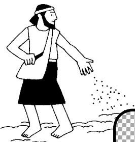
Church Clip Art Mega Pack, Gospel Light, Ventura, CA