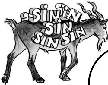
UNDER THE LAW "Every year"

All the words of this passage are contained in the block of 81 letters. Words run horizontally, vertically, and diagonally. They may be spelled forward or backward. Do not use a word that is found completely within another word. Unused letters complete the Puzzle Bonus.