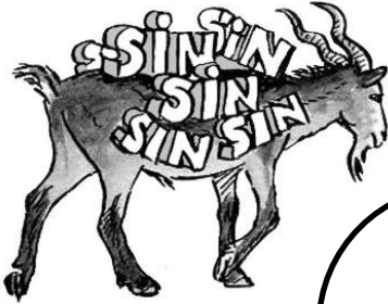
UNDER THE LAW "Every year"

Open an English Standard Bible to Leviticus 16:30. All the words of this verse are contained in the block of 81 letters. Words run horizontally, vertically, and diagonally. They may be spelled forward or backward. Each word must be found separately. Do not count a word that is found completely within another word. Unused letters complete the Puzzle Bonus.