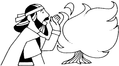
Church Clip Art Mega Pack, Gospel Light, Ventura, CA

Open an English Standard Bible to Exodus 3:5. All the words of this verse are contained in the block of 81 letters. Words run horizontally, vertically, and diagonally. They may be spelled forward or backward. Each word must be found separately. Do not count a word that is found completely within another word. Unused letters complete the Puzzle Bonus.