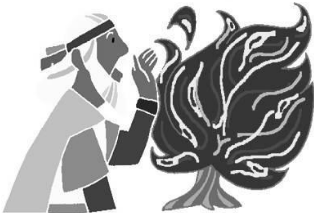
Church Clip Art Mega Pack, Gospel Light, Ventura, CA